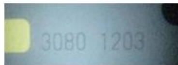
After ( UV laser)