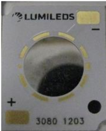
Before ( Fiber laser)