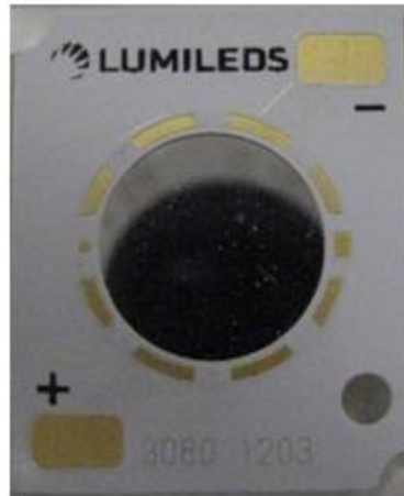
After ( UV laser)