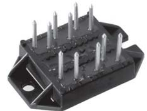
Pin arrangement see outlines